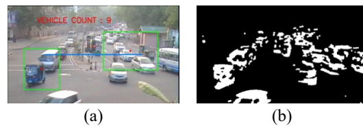
Figure 03: (a) Sample frame for detection and counting vehicle (b) Grayscale image of the sample frame

The traffic controlling algorithm is based on queuing theory. We have considered the traffic flows which follow the M/M/1 Queuing Theory. This algorithm mainly finds the green light time of the traffic light, and according to Traffic Engineering, it is equal to the waiting time of a vehicle.