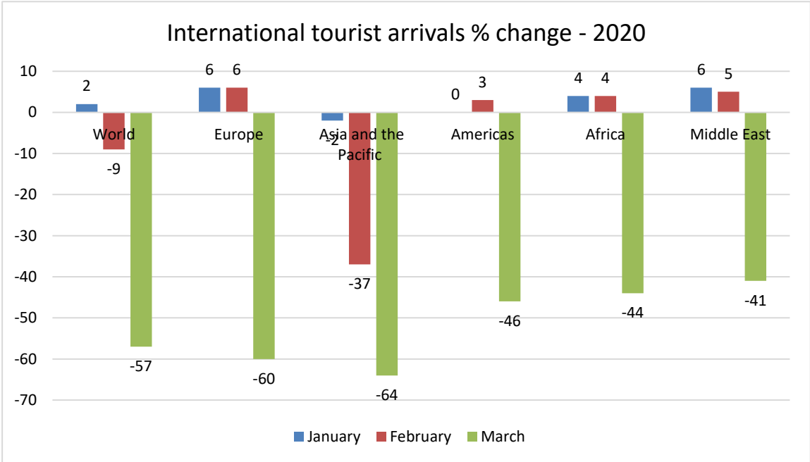
Figure 2: International Tourist Arrivals % change within January-February –March 2020

for international tourists, whereas 65 destinations (or 30%) have suspended totally or partially their international flights. Further, 39 destinations, or 18% out of the total are implementing these guidelines in a differentiated manner, as stated by the UNWTO, banning the entry for foreign passengers from specific countries or regions (UNWTO, 2020). Therefore, the economies that are highly surviving in the tourism receipts or foreign exchange will be in a massive trauma due to the travel restrictions. Figure 2 illustrates the gradual drop in International tourist arrivals within the months January-February –March 2020 with the first wave of the Covid-19 pandemic.