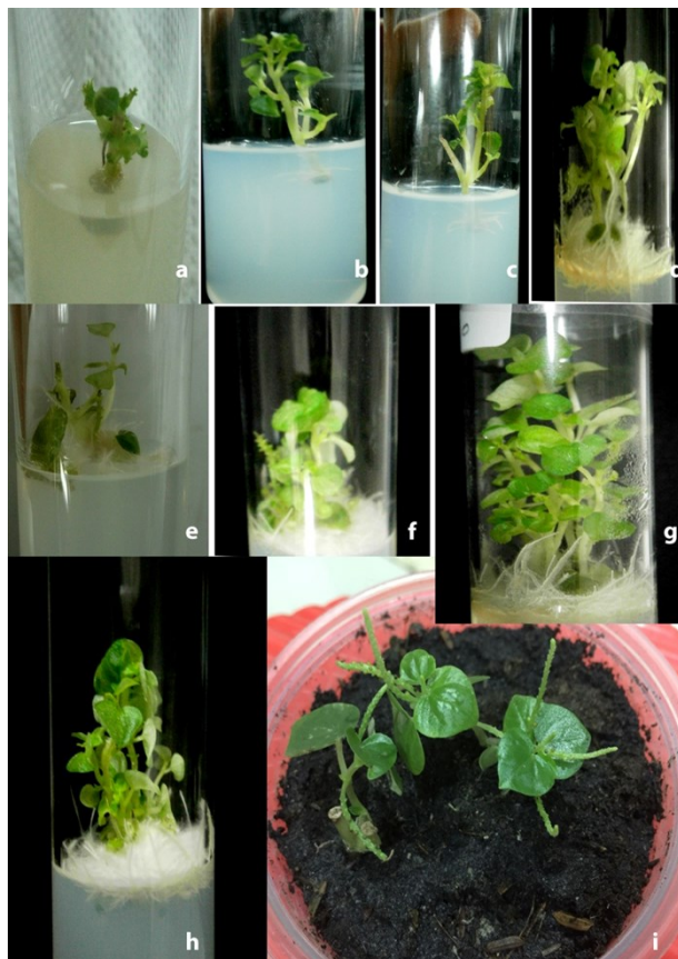
Figure 2: In vitro propagation from axillary node explants of Peperomia pellucida (L.) Kunth. (a) Multiple shoot initiation from axillary node explants on MS medium with 2.0 mg L -1 KIN after 6 weeks of culture, (b) Adventitious shoot regeneration on MS medium with 1.5 mg L -1 BA, (c) Shoot multiplication on MS medium with 2.0 mg L -1 and 0.5 mg L -1 NAA, (d) Root induction and proliferation on MS medium with 1.5 mg L -1 IAA, (e) Root proliferation and shoot development on MS medium with 1.5 mg L -1 IBA, (f) Adventitious shoot and root development on MS medium with 1.5 mg L -1 NAA, (g-h) Maximum shoot and root development from axillary node explants; (i) Acclimatized plants with ex vitro flowering from axillary node explants after 3 months.

centration combination with high cytokinins concentration promoted shoot proliferation in Crambetataria (Piovan et al. 2011) and P. Obtusifolia (Hany and Amira 2014) belongs to the family Piperaceae. In vitro propagation is an excellent technique to obtain maximum number of plants within a short period of time. Our studies showed that axillary node developed shoots were tall as well less shoot indicating that cytokinins-auxin have shown