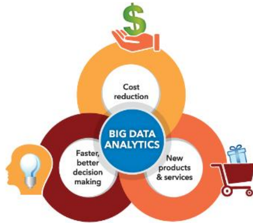
Fig. 1. Big Data Analytics Organizational Benefits