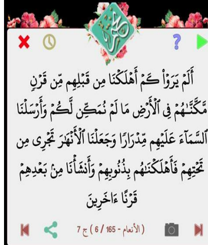
Fig. 3: Nakhtim Quran Verses

The mobile application not only brings closer to Allah's message every now and then but also abide you by bad doings, message or people. it makes logic as if you read the message of Allah a moment ago, Also the mobile application is recommended by Mufti Ismail Menk in his lecture. Its reviews are good and overall rating is 4.8 the wonder of this app it brings in the life just in a time.