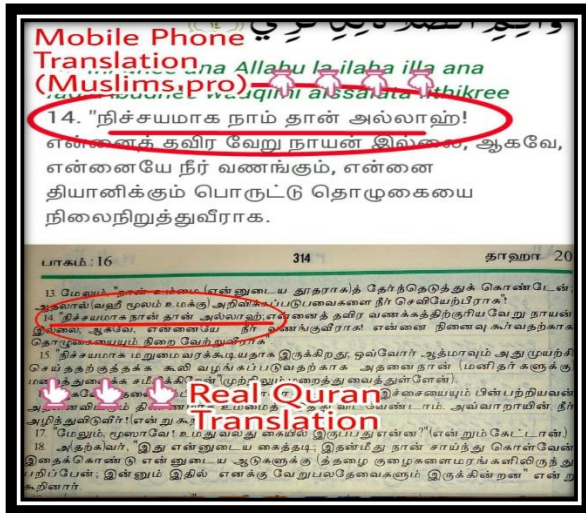
Figure2: wrong translation